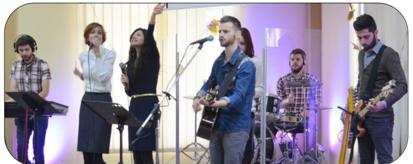
singer in a worship band