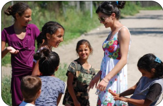
helping poor children